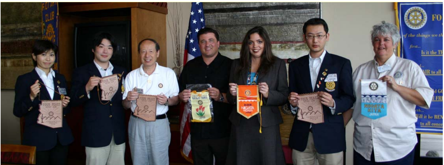
Rotary International District 2560, Niigata Japan visits Four Peaks Rotary